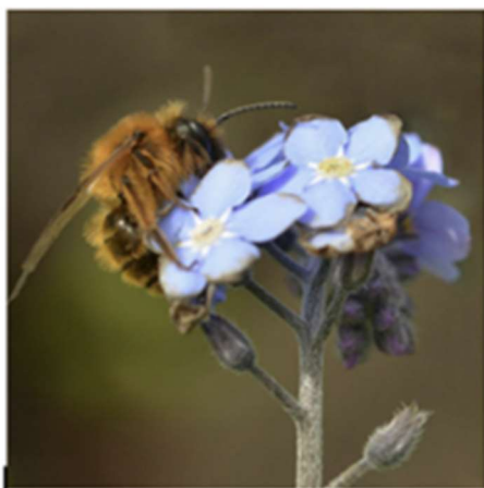
Male Buffish Mining Bee on Forget me nots

Work continues most Tuesday and Saturday mornings to improve the churchyard for both people and wildlife. We are lucky that local wildlife photographer, Nick Hollands, has been documenting the wildlife seen, including a large variety of bees.