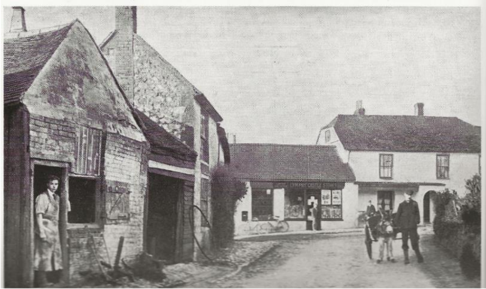
Lympne (Corner of The Street and Castle Close) c 1906